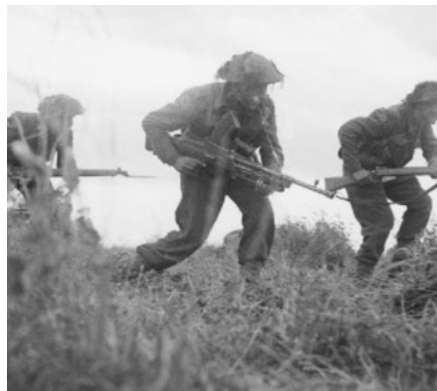
F Coy, 8 RB, Advance in contact, Hill 112, 29th June 1944.

This was the first of many actions by the 8th Rifle Brigade on the advance to Germany.